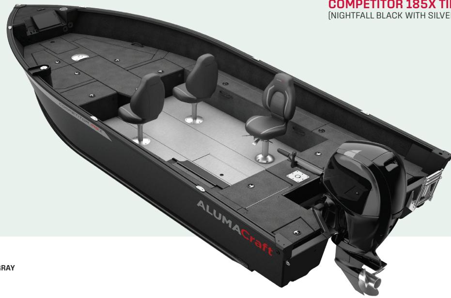
COMPETITOR 185X TILLER [NIGHTFALL BLACK WITH SILVER ACCENT]