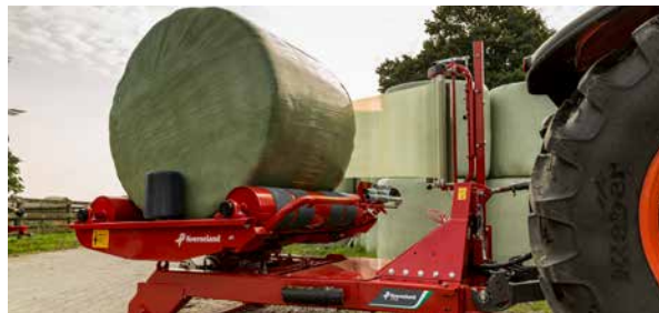
Able to handle round balers up to 1200 kg.