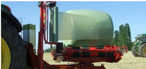
Bale and wrap counter is standard.

Farmer wrapper ideal for 'wrap & stack' operation