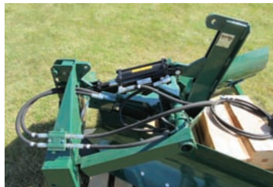
Rugged main frame for long life and stability.