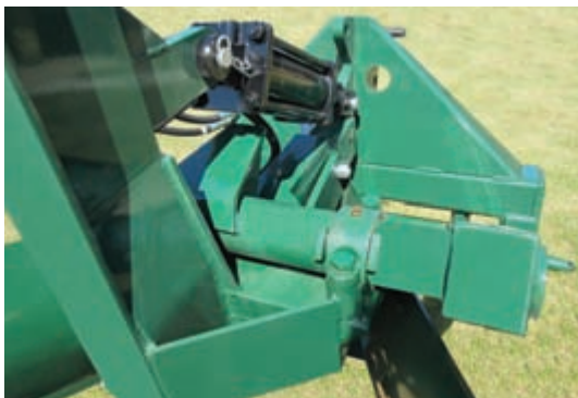
Hydraulic lift operation using tractor hydraulics.