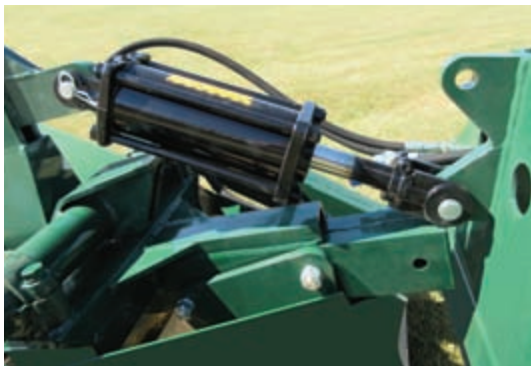
4-½ in. diameter depth control cylinder maintains accurate depth of cut.