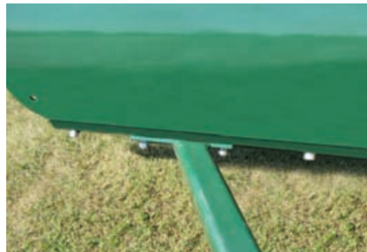
Reinforcement bar on 7 ft. model.