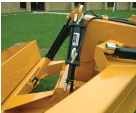
Rear side cylinder provides blade tilt control up to 15 degrees in either direction