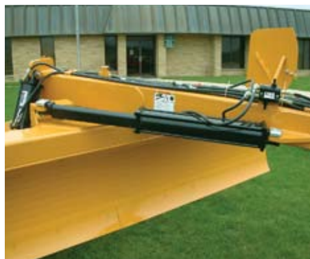
Main two cylinders (with relief valve) provide blade angle control up to 43 degrees either direction