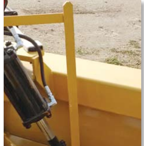
Blade Level Indicator

It is easy to keep a close eye on the tilt of the blade by using the blade level indicator mounted within clear view. Monitor the direction of the grader equipped with alignment posts and keep your grader in proper position.