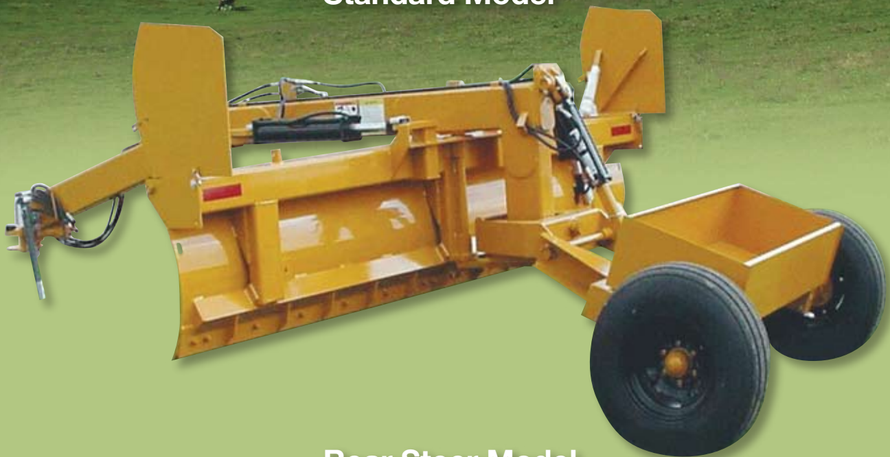
Rear Steer Model