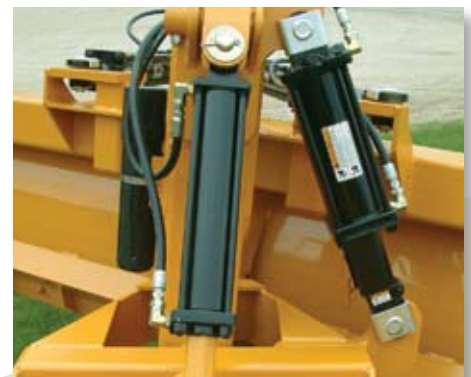
Rear cylinder provides depth control for convenience of different cutting positions