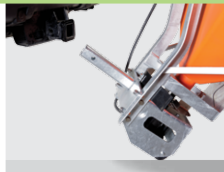
ROLLER WHEELS MAKE MOUNTING EASY

Our superior salting solutions are now even better. Arctic's newest spreader is engineered with two things in mind: ease and durability. This spreader is very easy to operate and maintain, and offers a new level of toughness, courtesy of our innovative galvanized coating and tough poly hopper.