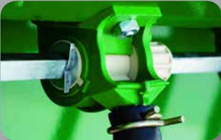
SMALL SEEDS BOX - Smaller version of the fluted feed cup precisely meters small seeds.