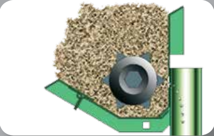
FERTILIZER ATTACHMENT - Easy cleanout and 6-point meter wheels accurately meter fertilizer.