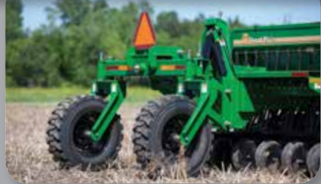
LIFT ASSIST - Two standard lift assist wheels in the rear of the 3P806NT provide greater lift capacity and assist the tractor's 3-point. Straddle axle caster wheels provide maneuverability and strength.