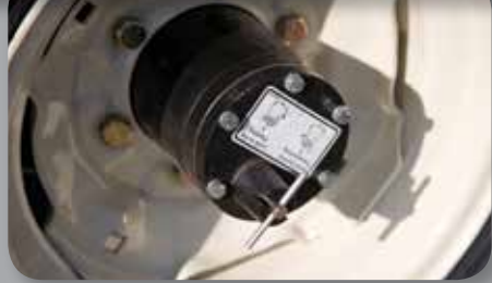
LOCK OUT HUBS - Disengages all drive components, reducing wear and tear during transport.