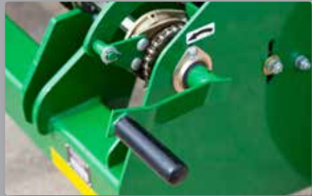
CALIBRATION CRANK - Specialty seeds are expensive. Calibrating your machine allows you to control the amount you use.