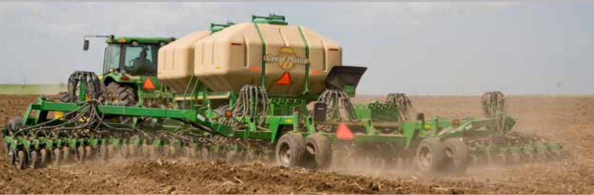
220 Bushel Air Cart