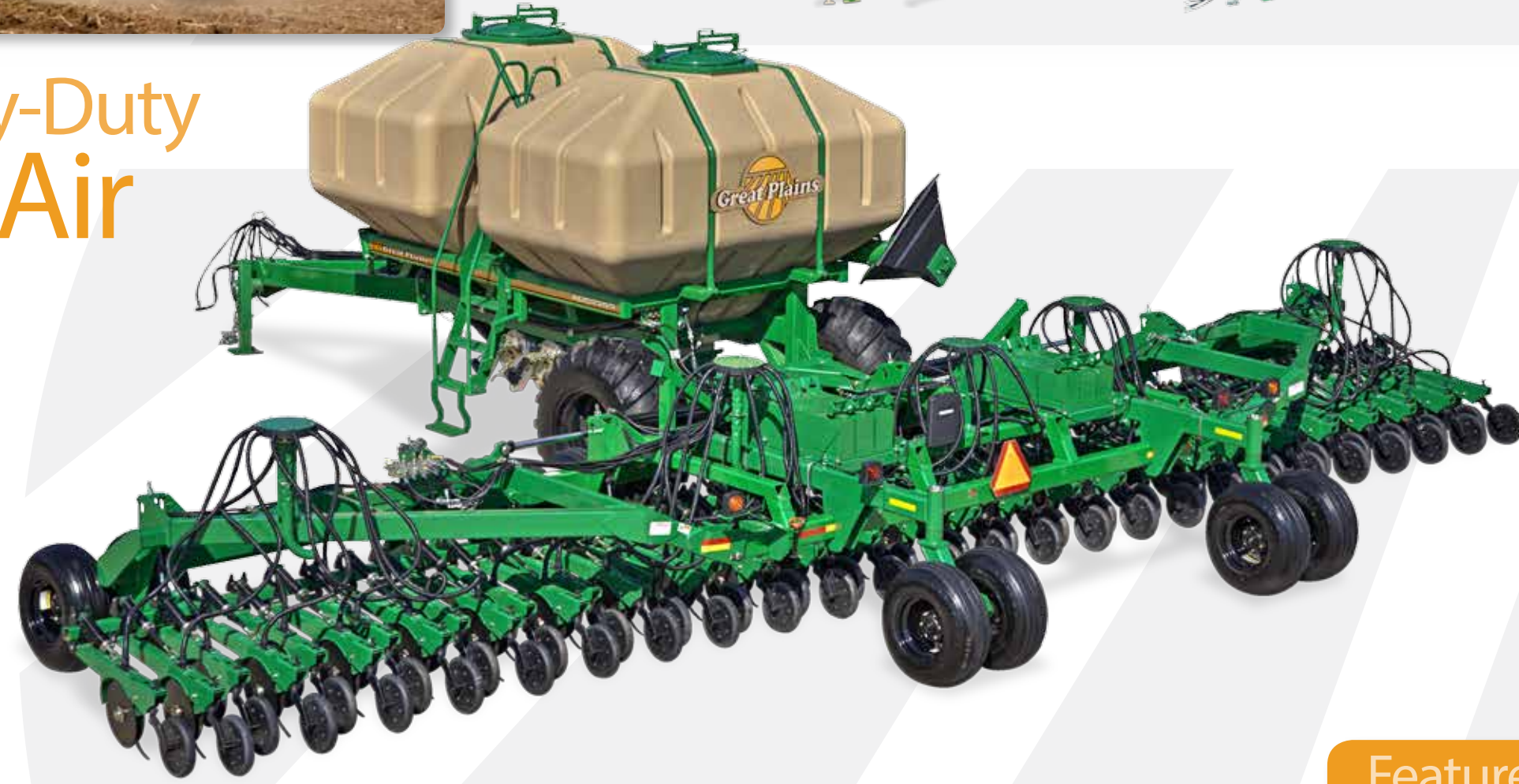
00 Series Opener