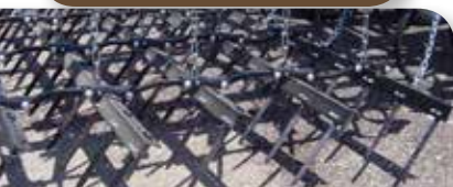
Hi Residue 5-Row Spike/7-Row Spike