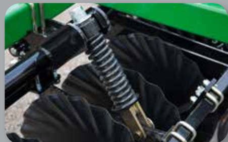
GANG DESIGN - Rugged gang design with concave or Turbo blades on 8" spacing and improved scraper design.