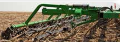
HD 3-Bar Spike with Reel