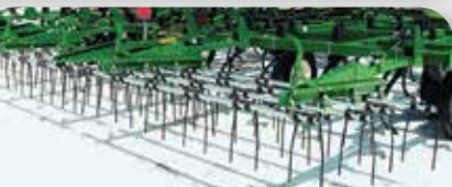
4-Row Coil Tine