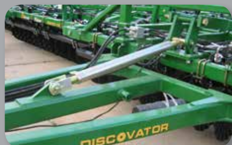
HITCH DESIGN - A clean, narrow-profile, self-leveling hitch design with turnbuckle height leveling adjustment.