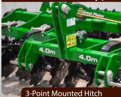
3-Point Mounted Hitch