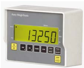
Model: Weigh Tronix 640

Simple Gross/Tar/Net weight indicator with adjustable back lighting, selectable weight filtering, 100 memory channels with individual statistics.