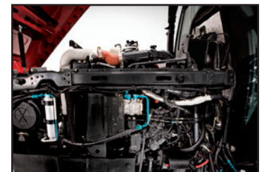
Engine - left side view