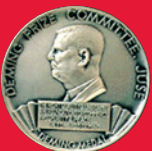
DEMING PRIZE 2003