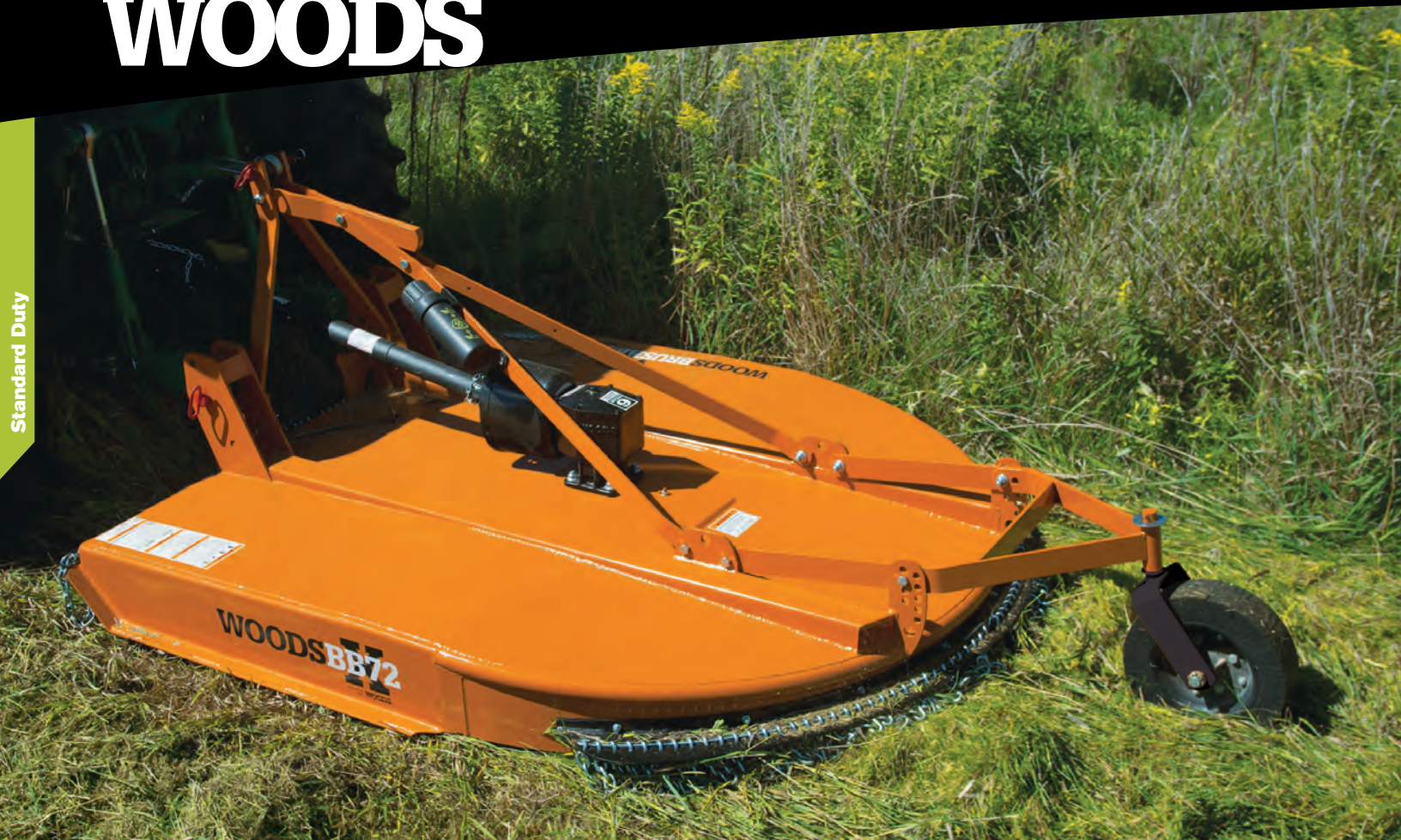
BB72X shown with optional chain shielding