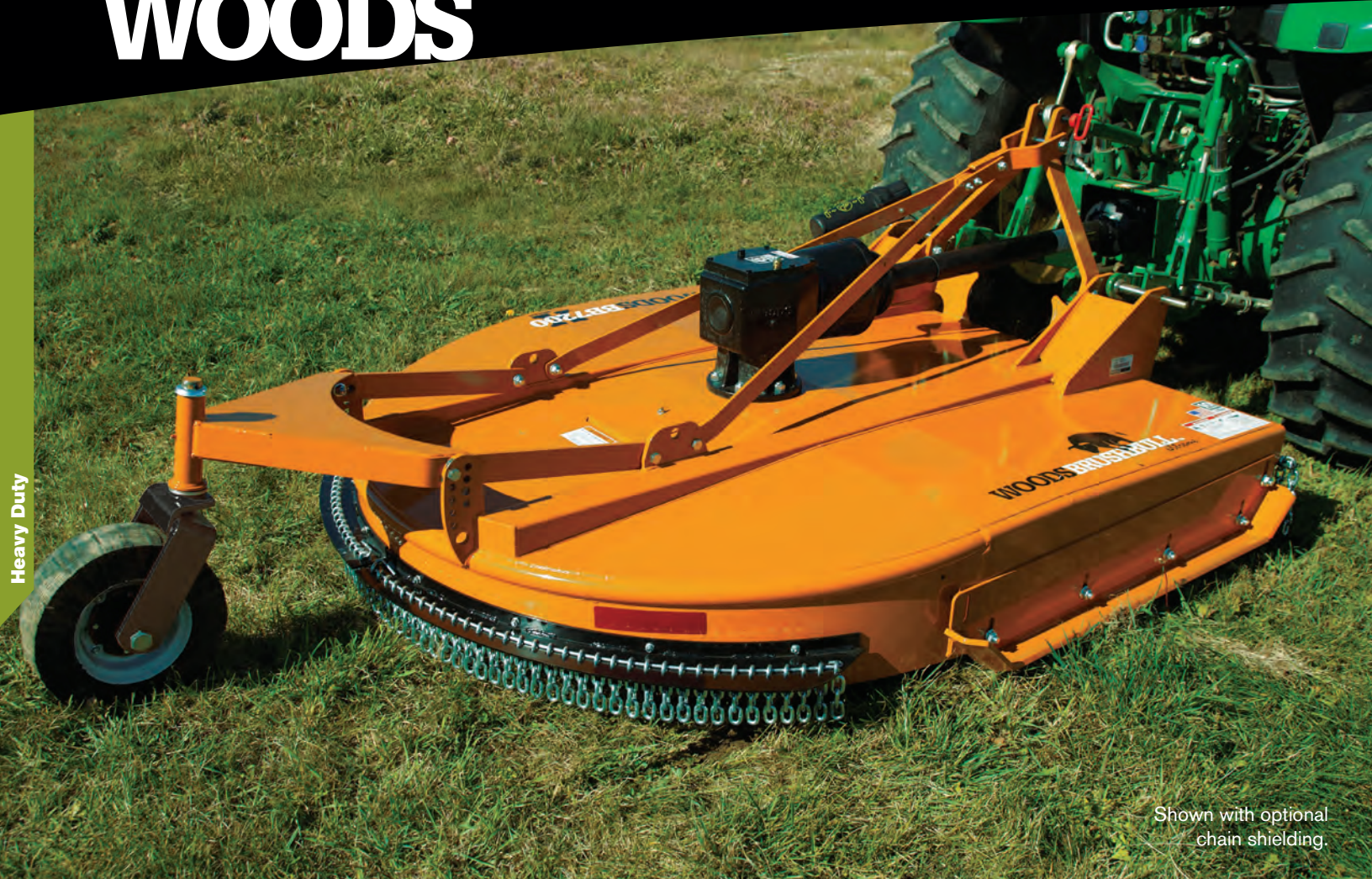
Shown with optional chain shielding.