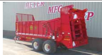
Meyer Crop Max Spreader with Suspension Style Trailer