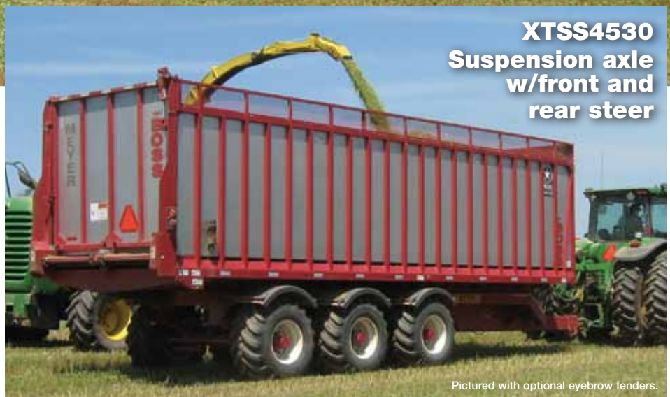
XTSS4530 Suspension axle w/front and rear steer