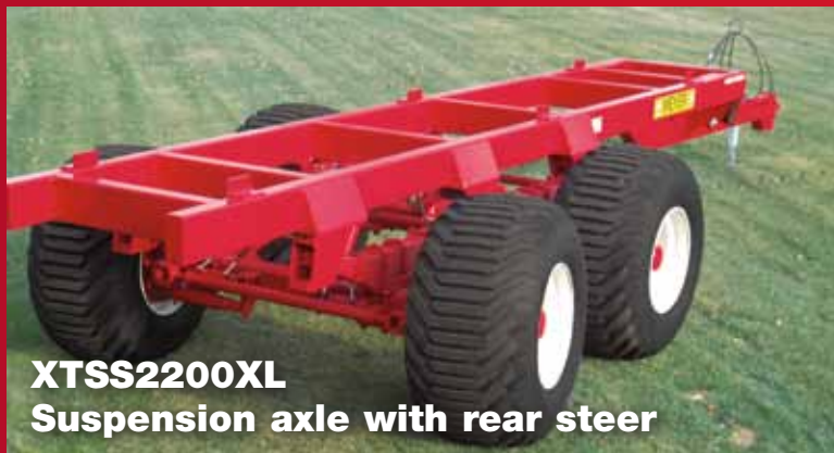
XTSS2200XL Suspension axle with rear steer