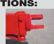
HD Swivel, Adj. Clevis XTS2200 Models • Std XT2200 Models • Opt