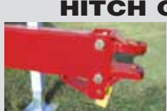
HD Adjustable Clevis XT2200 Models • Std