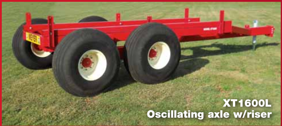
XT1600L Oscillating axle w/riser