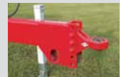
Articulating Imp. Hitch XTSS2226, XTSS4500 • Std XT2200, XTS2200 • Opt* *Requires hammerstrap drawbar