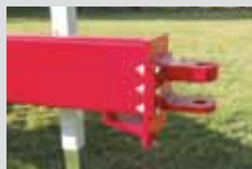
Adjustable Clevis XT1600 Models • Std