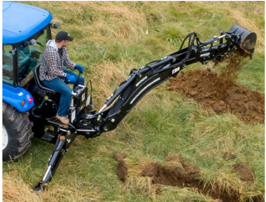
BH100 shown with optional thumb

Woods BH100 backhoe received the 2020 ASABE award for outstanding innovation in engineering and technology.