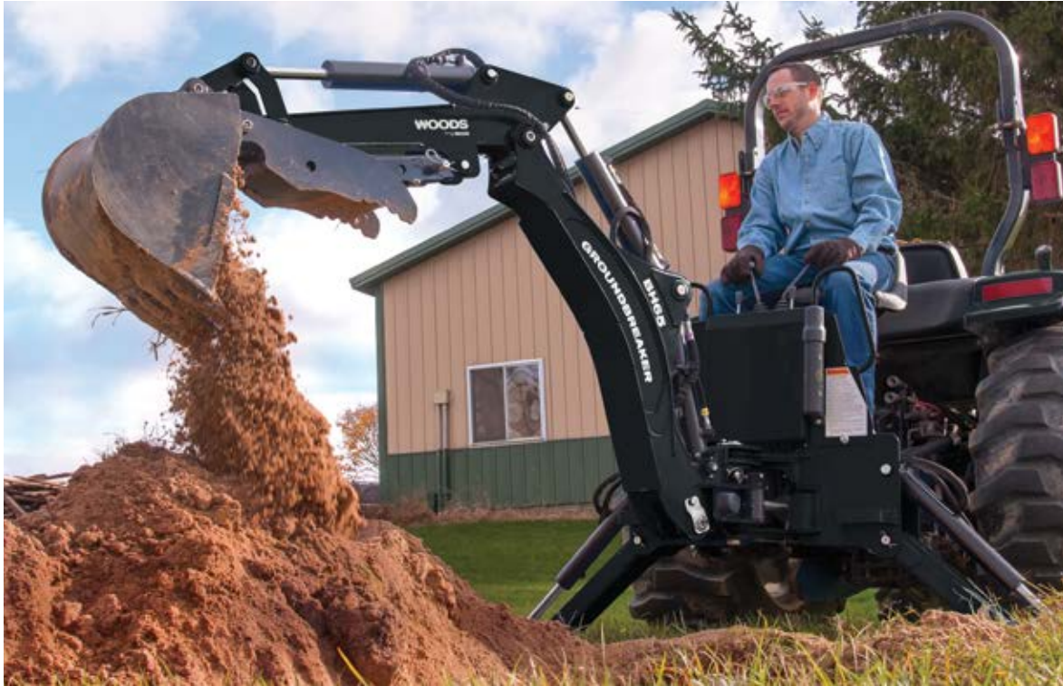
BH65 shown with optional thumb