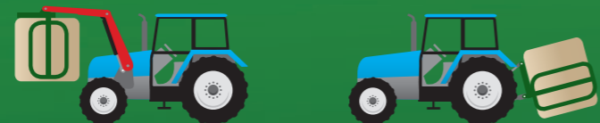
Loader crowd ram allows the bale to be rotated through 90 degrees

The soft hands combo is fully compatible with all proprietary front-end loaders and connects quickly and simply to the loader frame and hydraulics. Or simply attach the Soft Hands to the 3 point linkage, either way you get safe, convenient driver control.