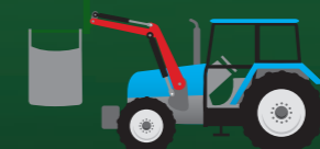
Fork arms with front end loader attachment can handle a 1000kg fertilizer bag

Hustler has been producing tractor-mounted forklifts for industry and horticulture for more than 20 years. The System 10™ fork arms are built to the same exacting standards and carry a full 1000kg load rating.