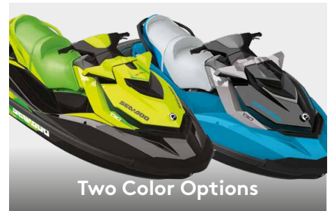
Two Color Options

Both Rotax 1503 engines have been tested and proven to be incredibly reliable while the 1503 NA is the most powerful, naturally aspirated engine on a Sea-Doo®. 1