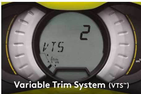
Variable Trim System (VTS™)

Makes boarding from the water easier and quicker.