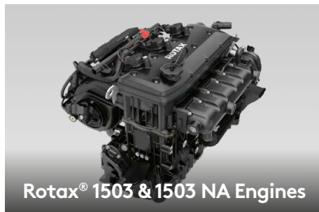
Rotax® 1503 & 1503 NA Engines

Allows riders to easily find the ideal trim setting for different water conditions.