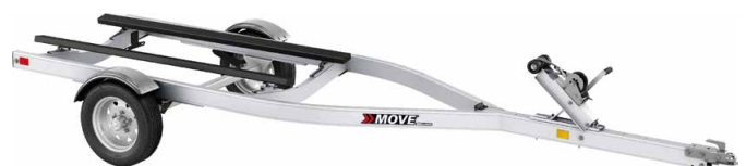
Aluminum MOVE I Extended 1250