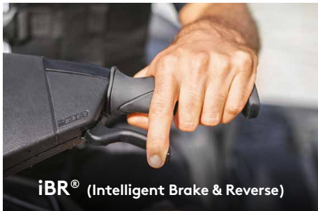
iBR® (Intelligent Brake & Reverse)

Exclusive to Sea-Doo®, iBR® stops the watercraft sooner and provides more control and maneuverability at low speeds and in reverse.