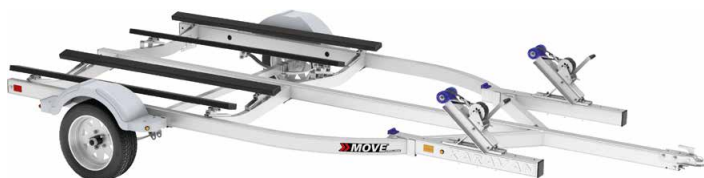
Aluminum MOVE II