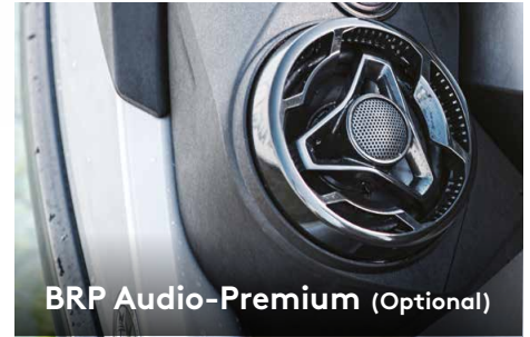
BRP Audio-Premium (Optional)

Exclusive quick-attach system on the largest swim platform in the industry that allows for easy installation of accessories.