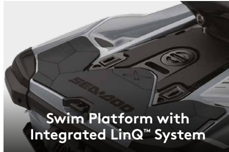
Swim Platform with Integrated LinQ™ System

Large front storage area that's easily accessible from a seated position. 1