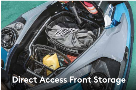
Direct Access Front Storage

Large front storage area that's easily accessible from a seated position. 1