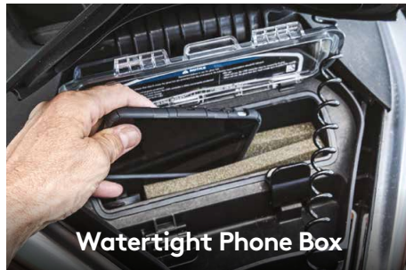
Watertight Phone Box

The Rotax® 1503 NA offers instant acceleration for instant fun while the 1500 HO ACE™ features a powerful supercharger and is equipped with Advanced Combustion Efficiency (ACE) technology.