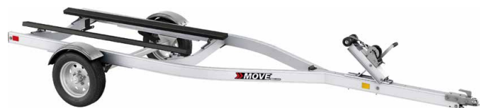
Aluminum MOVE I Extended 1250