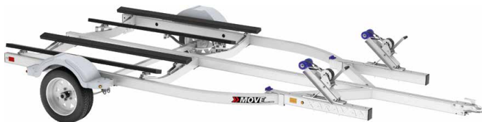
Aluminum MOVE II