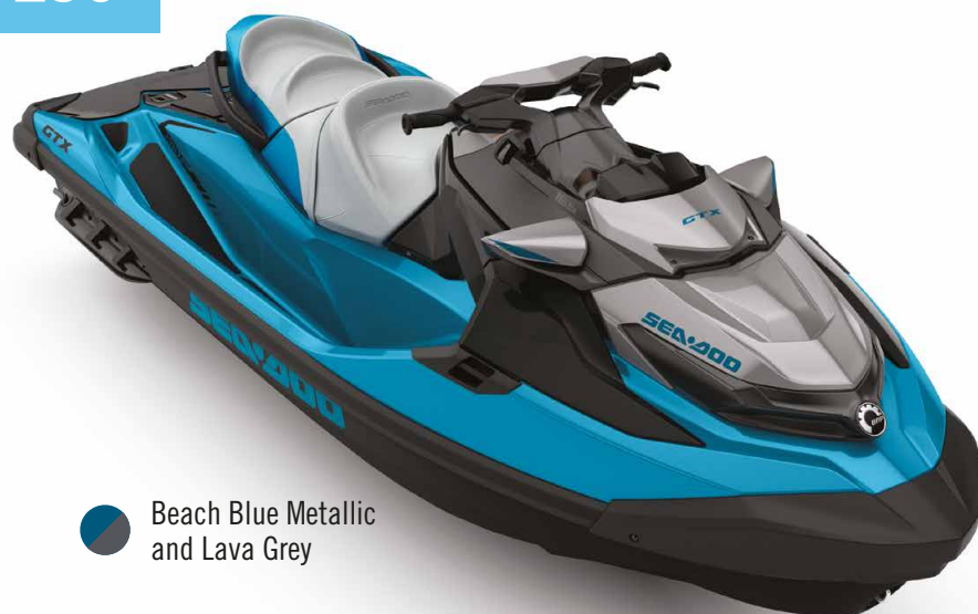
Beach Blue Metallic and Lava Grey