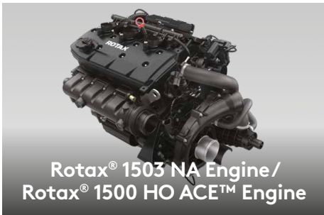
Rotax® 1503 NA Engine/ Rotax® 1500 HO ACE™ Engine

An industry-first manufacturer-installed, truly waterproof, Bluetooth † audio system. 2