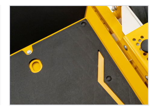
Front & Rear Tie Downs