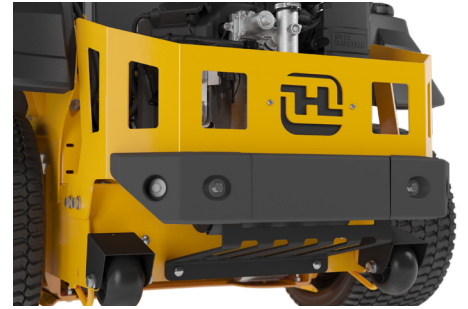
7 ga. Engine Guard