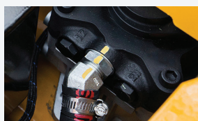
Industrial-Grade Slipper Piston Pumps