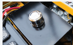
Large Oil Reservoir