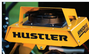
9" Fan & High-Capacity Oil Cooler with Hot Oil Shuttle

Reducing the temperature of the oil in your wheel motors is a key to extending the life of your hydraulic system. Hustler's exclusive HyperDrive® system helps do just that with temperature regulation and heavy-duty components designed to keep your mower at peak performance.