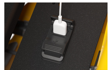
Dual USB Port