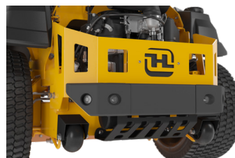
7 ga. Engine Guard

LIMITED WARRANTY 5 YEAR | 1200 HOUR FIRST 2 YEARS NO HOUR LIMIT