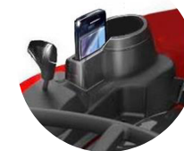
5. Wireless smartphone charger