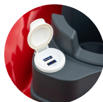
3. 2 USB ports