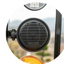
4. Bluetooth speaker with IP66 grade waterproofing