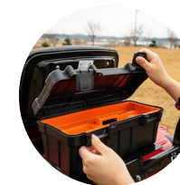
6. Wide loadspace with a well-equipped toolbox