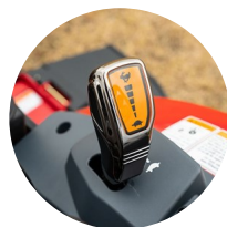
1. 2 range hydrostatic transmission (HST)

Get work done quicker with this small-frame tractor. Highly maneuverable and with maximized lift capabilities, the T25 is designed to be an all-round multi-tasking machine.