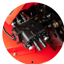
2. 3rd function for 4-in-1 bucket work (optional)