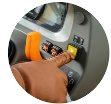
5. PTO switch