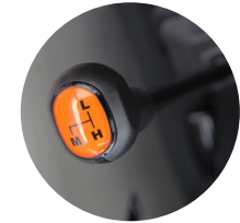
4. 3-range hydrostatic transmission