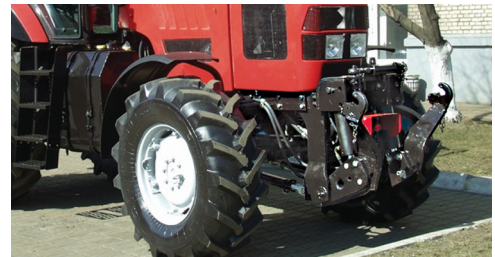
Available front hitch and PTO package