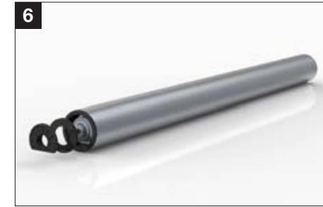
6 Seals on the idling rollers to keep crop contamination away