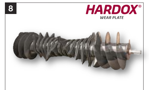
8 Opticut – Integral Rotor, with the 19-knife OptiCut System, designed for unlimited intake capacity and excellent cutting quality