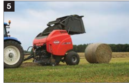
5 Within 4 seconds the bale is ejected and the tailgate is closed again