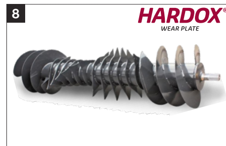
8 OptiFeed – Non-cutting Integral Rotor with single tines and integrated augers provides a consistent flow of crop into the bale chamber