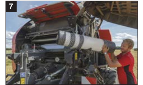
7 Support brackets for easy loading of the net roll