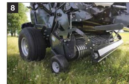
8 TwinCharge – Unrestricted intake unit for maximum capacity in all crop conditions