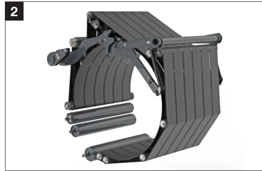
2 6 belt, 3 roller design of the bale chamber ensures fast, consistent bale formation in any crop condition