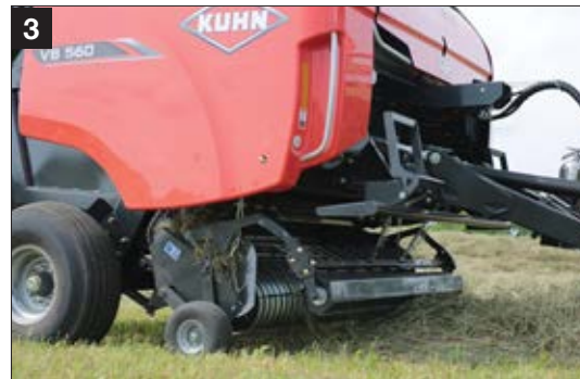
3 90" wide pickup with 5-tine bars to collect all the crop every time