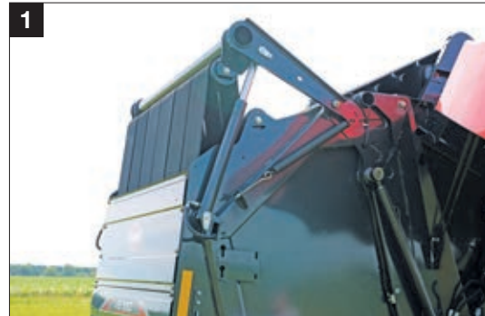
1 Twin tensioning arms provide higher density from improved belt tension control and response time.