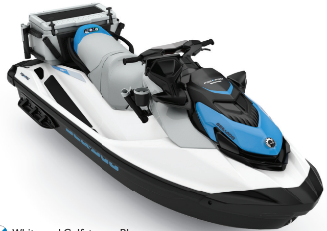
White and Gulfstream Blue