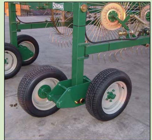
Optional sturdy tandems

The heavy duty raking wheels have a very durable and attractive gold-colored plated finish instead of paint. General hardware and some smaller components are also plated to match this theme. All wheel hubs have tapered roller bearings instead of ball bearings. Each rake wheel hub has grease zerks to make routine lubrication tasks quick and easy. The adjusting ratchet on the rear makes windrow adjustments easier. Very desirable performance features and it's attractive looks make the Sovema CROPMASTER V-rakes a wise choice.