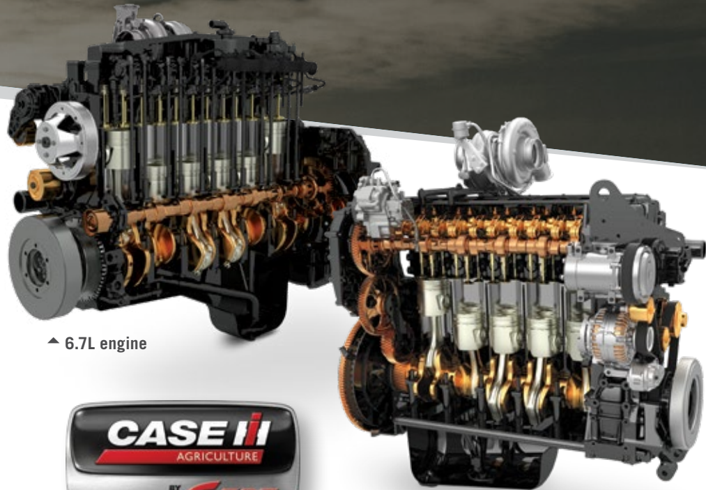
▲ 6.7L engine