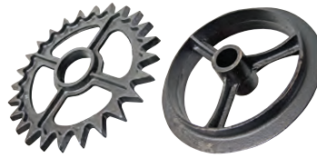
15" & 18" sprocket/plane

5-year Warranty on all ductile iron wheels