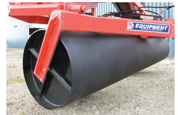
Optional 30" diameter drum roller

Ratchet adjustment easily levels the tongue pitch for equalized packing across the full width of rollers