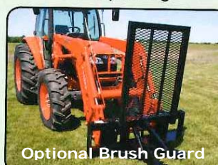
Optional Brush Guard