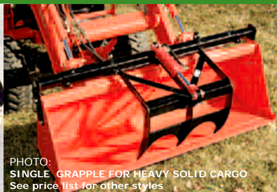
PHOTO: SINGLE GRAPPLE FOR HEAVY SOLID CARGO See price list for other styles