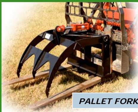
PALLET FORK GRAPPLE

Convert your standard bucket or pallet fork into a Grapple