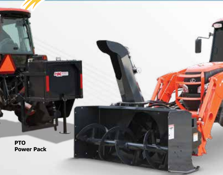
PTO Power Pack