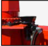
Hydraulic (orbital motor)