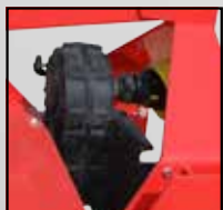
1000 RPM Kit

Available on the 97 and 108 models, a kit is available to allow larger tractors to run at 1000 RPM PTO. The 1000 RPM Kit also raises the input shaft to allow the PTO shaft to run at a lesser angle on larger tractors increasing the efficiency and life of the driveline components.