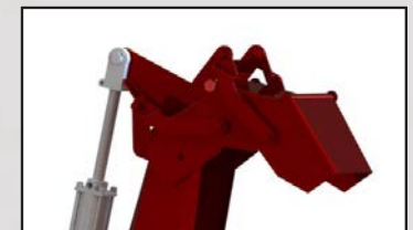
*Cylinder not included

Meteor's Multi Hinged Deflector provides you with finer control over where your snow is blown.