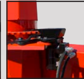
Hydraulic (orbital motor)