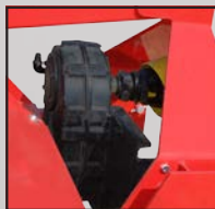
1000 RPM Kit

Available on the 97 and 108 models, a kit is available to allow larger tractors to run at 1000 RPM PTO. The 1000 RPM Kit also raises the input shaft to allow the PTO shaft to run at a lesser angle on larger tractors increasing the efficiency and life of the driveline components.