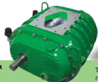
510 SRT BLOWER

The 3510 AGRI-VAC , The 3510 machine moves almost all agricultural products on a cushion of air, maintaining grain and especially seed quality. It provides versatility for any operation because of its portability. It can be maneuvered into the tightest corners, it transfers product easily, so cleaning up or loading