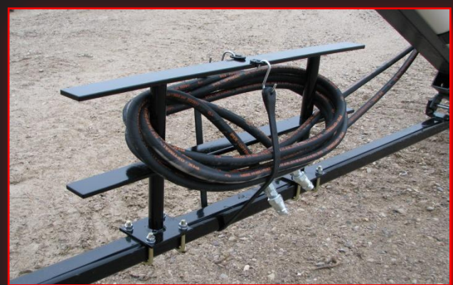
HOSE KITS & HOSE CADDIES