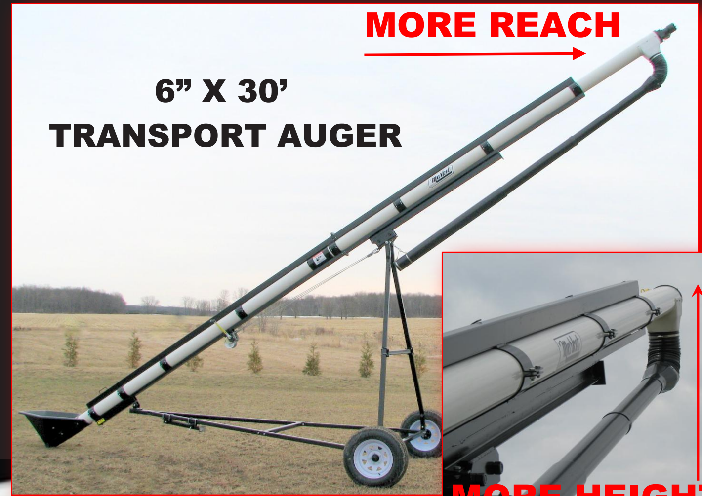
6" X 30' TRANSPORT AUGER