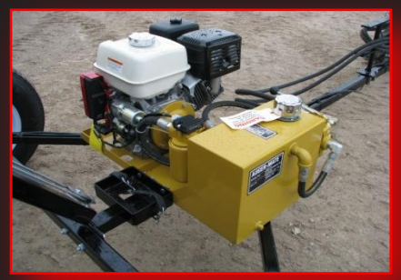
(AUGER-MATE) HYDRAULIC POWER UNIT