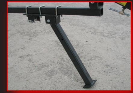
BOLT ON JACK STAND