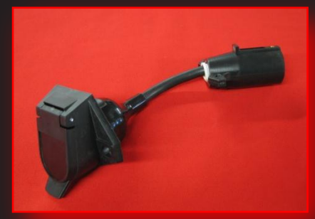
ADAPTOR PLUG (ROUND TO FLAT)