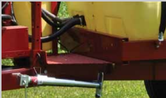
A large working platform is standard for filling and cleaning of the sprayer