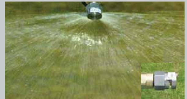
An optional Pasture boom is available with the # 10 Hamilton nozzle (50' spray width)