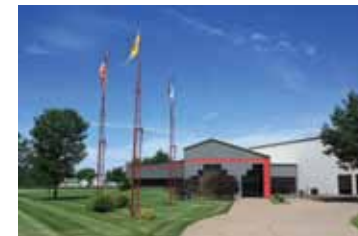
HARDI North America, Davenport, IA

Since 1957 HARDI has committed to the ever-increasing demands for efficient and precise plant protection. HARDI is the trendsetter within application of crop protection products. To achieve this position continued developments and innovation are essential. HARDI is committed to the long term future of plant protection.