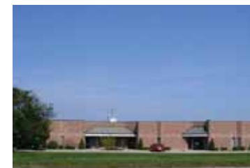
HARDI North America, London, ON