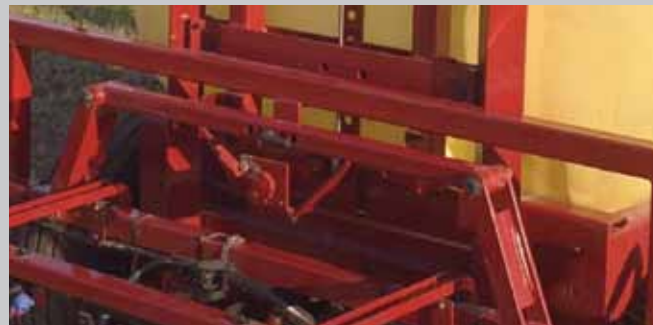
The MB booms feature a self-stabilizing trapeze boom suspension (40' and 45' booms only)