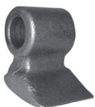
Hammer type FMM

Data refers to the machine without options.