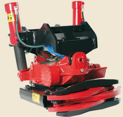
RT 60B S60/S60 with single acting cylinders and grapple module G710