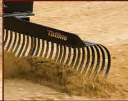
LR1-84 with optional gauge wheels