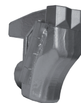
Tooth type C/SS (side scraper)