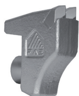
Tooth type C (standard)

Data data to the machine without options.