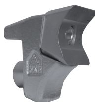
Tooth type D COBRA (option)