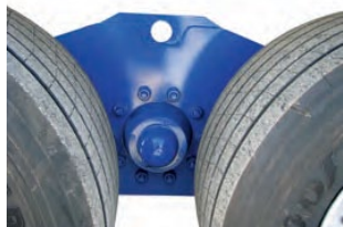
SD Walking Axle (Optional)