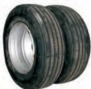
Hiway Commercial Dual Tires