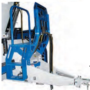
Bolt on Double Entry Safe Viewing Platform (Optional)

All Tornado Augers are equipped with 3 different styles of deep serrated, heat treated, tungsten carbide knives. 3 different style of knives depending on your nutrition needs can process any kind of fiber (hay, haylage, silage, straw, byproducts, corn and soybean stalks).