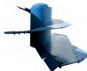
SD Tornado Auger Auger Thickness 1/2" (Option 3/4")