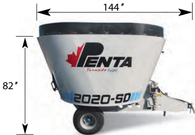
Model 2020 S.D. Low Pro Trailer Base Machine