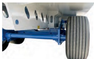
SD Frame Component