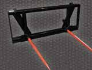
2 Prong Spear