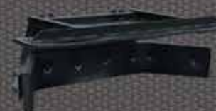
Free Stall Scraper