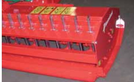
The Kverneland FHS can be equipped with rake tines to improve chopping on prunings.