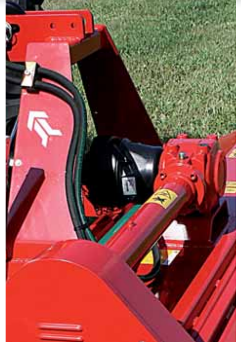
Gearbox up to 80hp - PTO speed drive 540 rpm. Protected by integrated free-wheel.