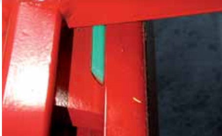
Special nylon plate fitted into sliding guide rail ensures smooth movements without the need for lubrication or maintenance.