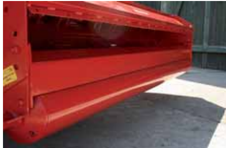
The rear roller is standard equipment, its diameter is 160mm. Adjustable scraper ensure a correct field performance.