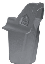
Tooth type A (standard)

Data refers to the machine without options. Technical data for models with mechanical transmission upon request.