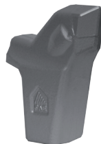
Tooth type F (option)