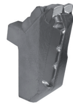
Side scraper Type MH