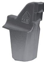
Tooth type A/HD (option)