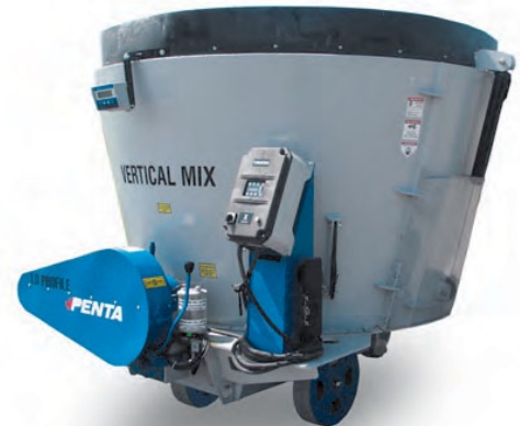
PENTA 3020 VS STATIONARY