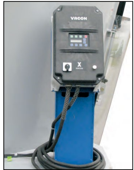
Variable Frequency Drive 1-60 rpm Auger Speed