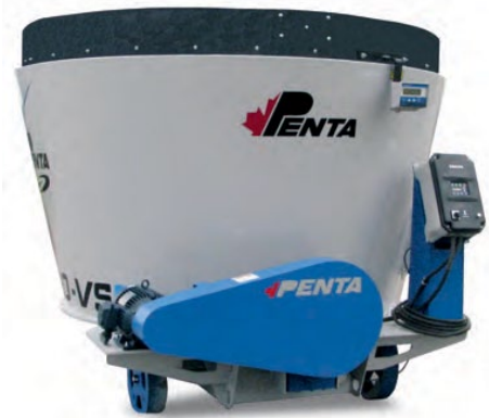
PENTA 3020 VS STATIONARY