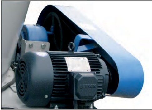
10 hp Drive Motor