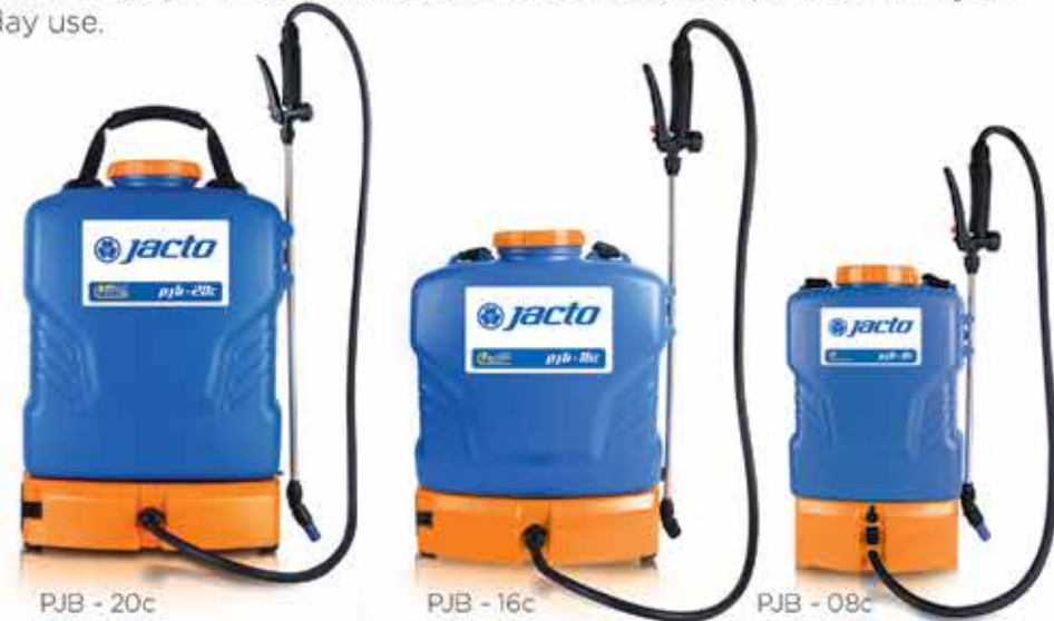
PJB - 20c

Lithium-Ion powered for positive energy and equipped with padded shoulder straps for comfort, Jacto's PJBc models are perfect for day-to-day use.