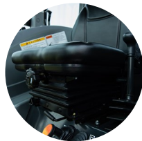
2. Comfortable suspension seat