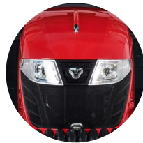
1. Hood design

High performance meets efficiency in this highly customizable Series 3 tractor that has the power to support your productivity.