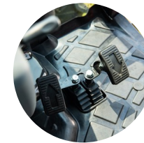
4. Highly responsive forward & reverse HST (4820CH)