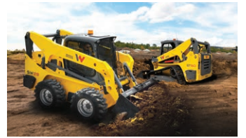
Skid Steer / Compact Track Loaders