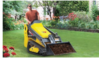
Utility Track Loaders