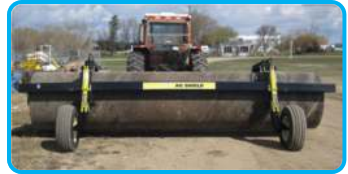
17 ft with leveler