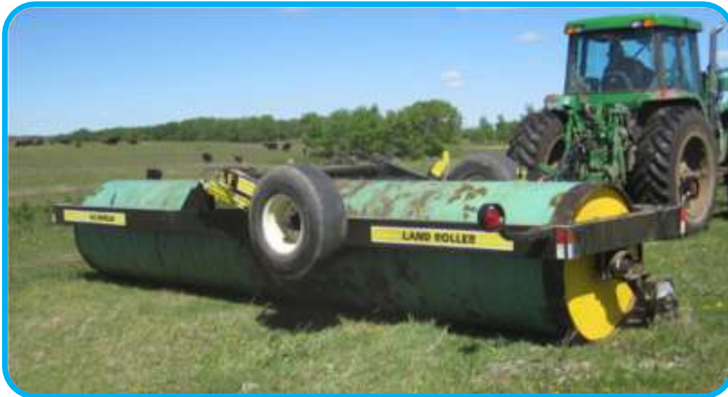
20 ft pivot unit with leveler in field