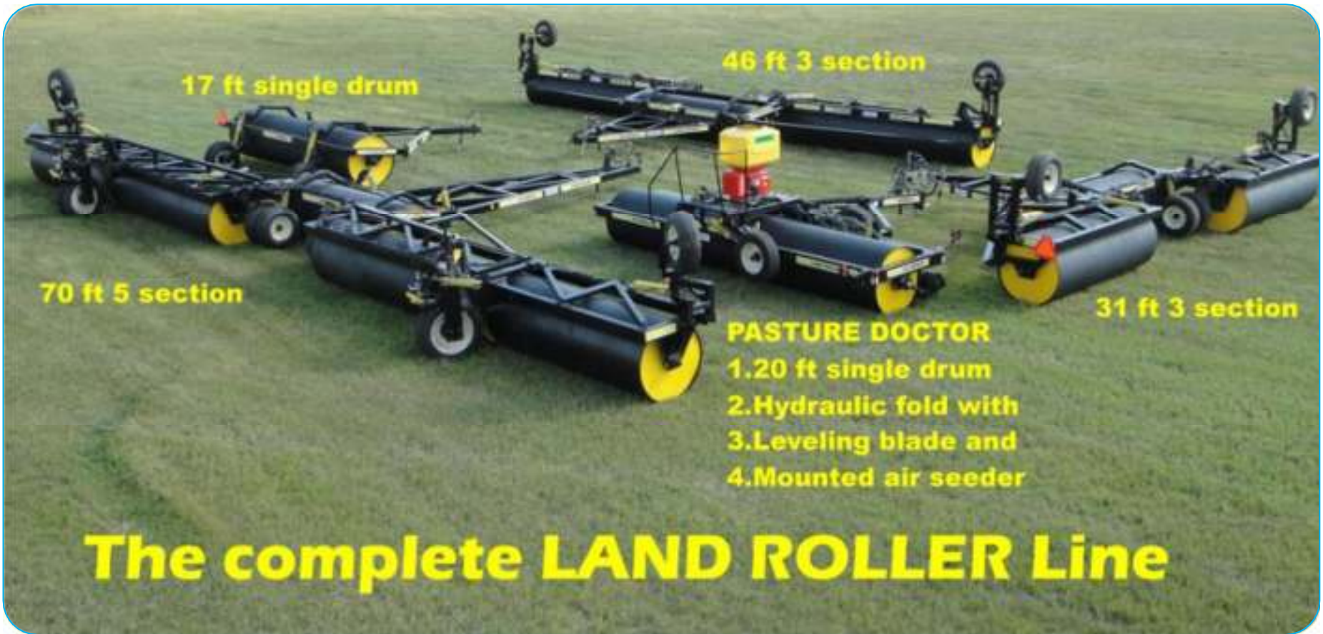
17 ft single drum