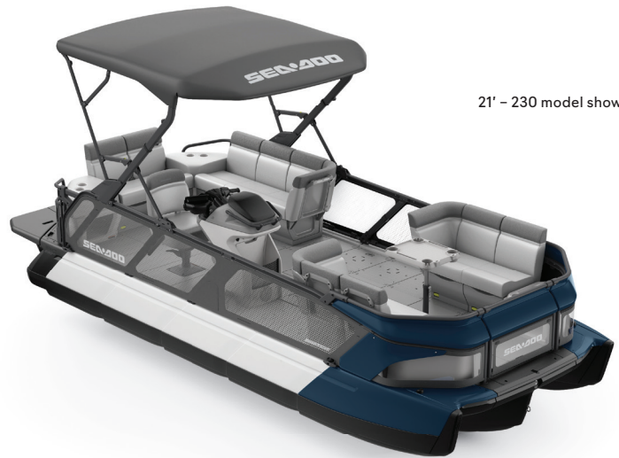
21' – 230 model shown